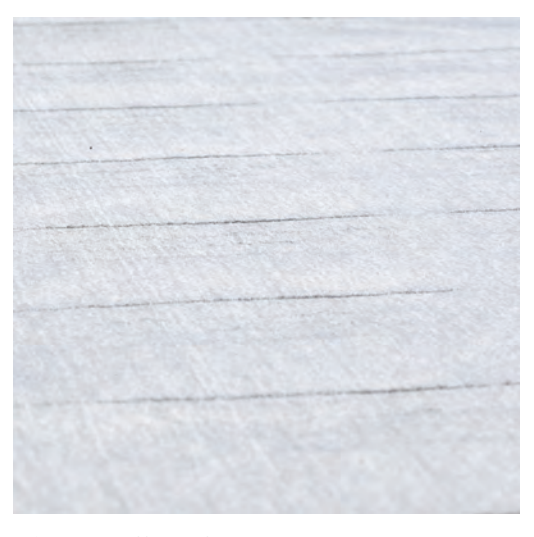
Cleaning effect of successive passes at 40mm per clean