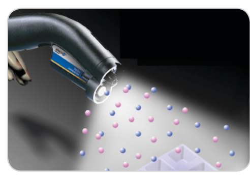
Ionizing Thermoformed Trays